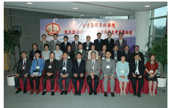
A group photo of the Ministry of Health's delegation with the representatives from our College.