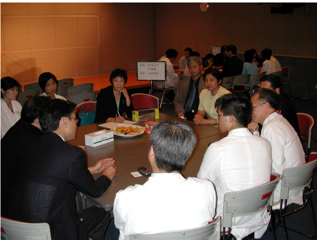
Some trainers and trainees explaining our training programme to the Ministry of Health's delegation.