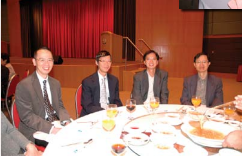
The Smile of the wise Four.