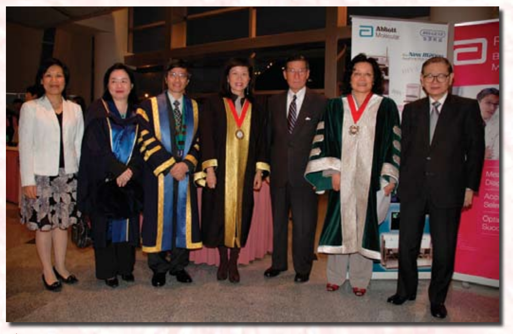
Guests at the reception right before the conferment.