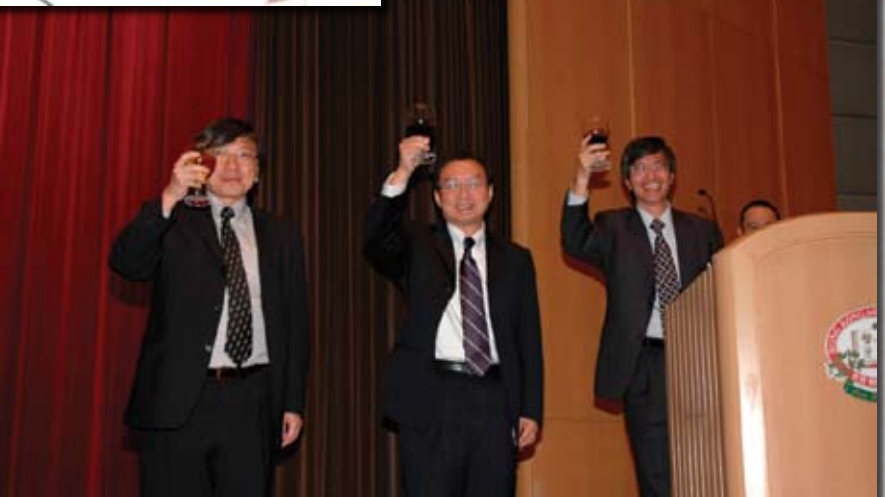
President and Vice-Presidents proposed a toast to bless the College.